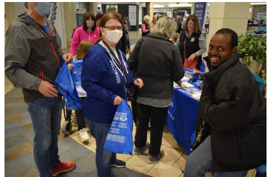
We enjoyed meeting everyone at the Summit Mall Senior Fair in October!

Visit our Senior Safety Website: www.co.summit.oh.us/prosecutor