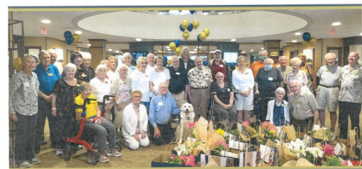
Thanks to Hudson Meadows Retirement Community for this year's cover photo